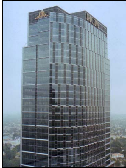
10250 Constellation Los Angeles, CA 90067